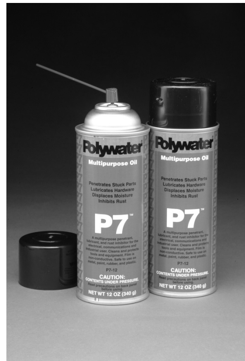
P7™ Multipurpose Oil Aerosol (cat. # P7-12) penetrates into tight spots and frees stuck parts.