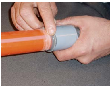
Smooth Excess Material

Place BonDuit® Conduit Adhesive cartridge into dispensing tool and snap into place. See tool instructions for more information.