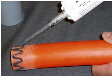
Apply BonDuit® Adhesive