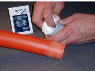
Clean Coupling and Conduit with Cleaning Wipe